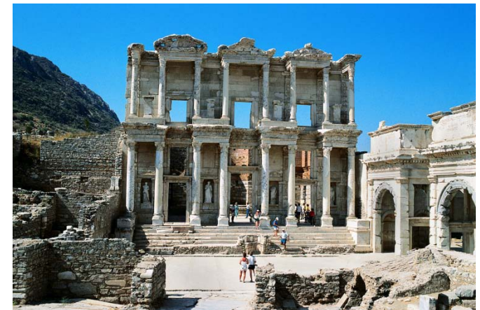
Ephesus Library of Celsus